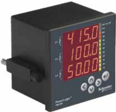
PowerLogic™ PM1000 power meter.